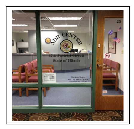
Alternative Dispute Resolution Center 308 West State Street, Suite 25 Rockford, Illinois 61101