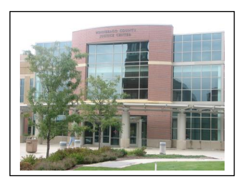
Winnebago County Criminal Justice Center 650 West State Street Rockford, Illinois 61102