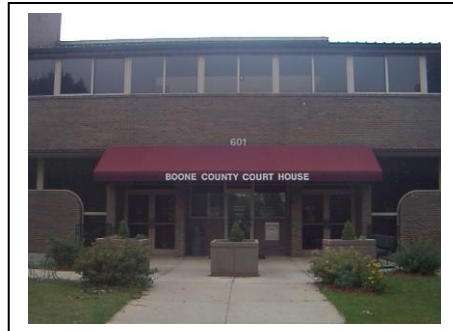
Boone County Courthouse 601 North Main Street Belvidere, Illinois 61008