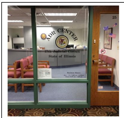
Alternative Dispute Resolution Center 308 West State Street, Suite 25 Rockford, Illinois 61101